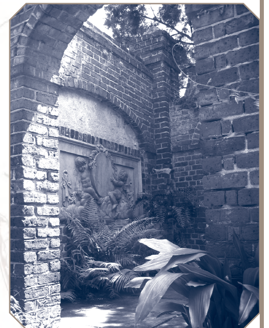
Focal point of a garden ruin