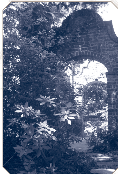
A secluded path leads to romantic ruins ▶