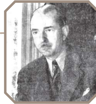
Loutrel W. Briggs Landscape Architect

Loutrel Briggs photo: courtesy of Post and Courier