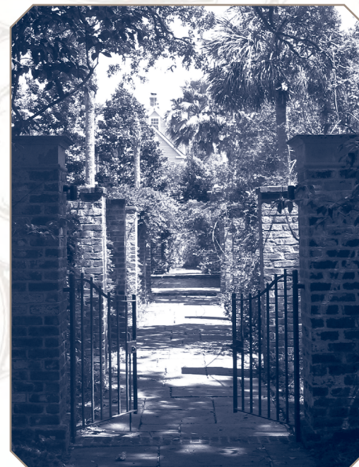
◀ This corridor of brick piers frames several garden rooms